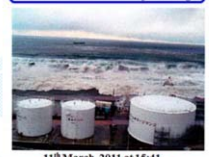
11th March, 2011 at 15:41 approximately 1 hour after the earthquake