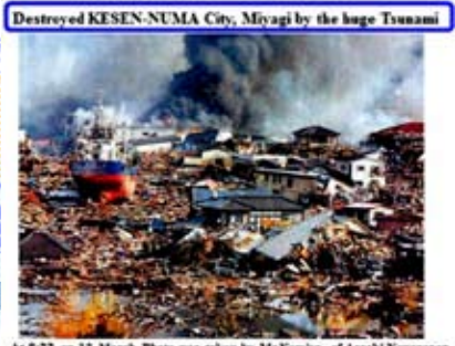
6:22, on 12, March

Of the six reactors at the TEPCO Fukushima Daiichi Nuclear Power Plants, Units 1, 2, and 3 were in operation at the time of earthquake. Units 4, 5 and 6 had been shut down for regular maintenance. All of the fuel in the reactor core of the Unit 4 had been transferred to the spent fuel pool in order to conduct regular maintenance. By detecting the