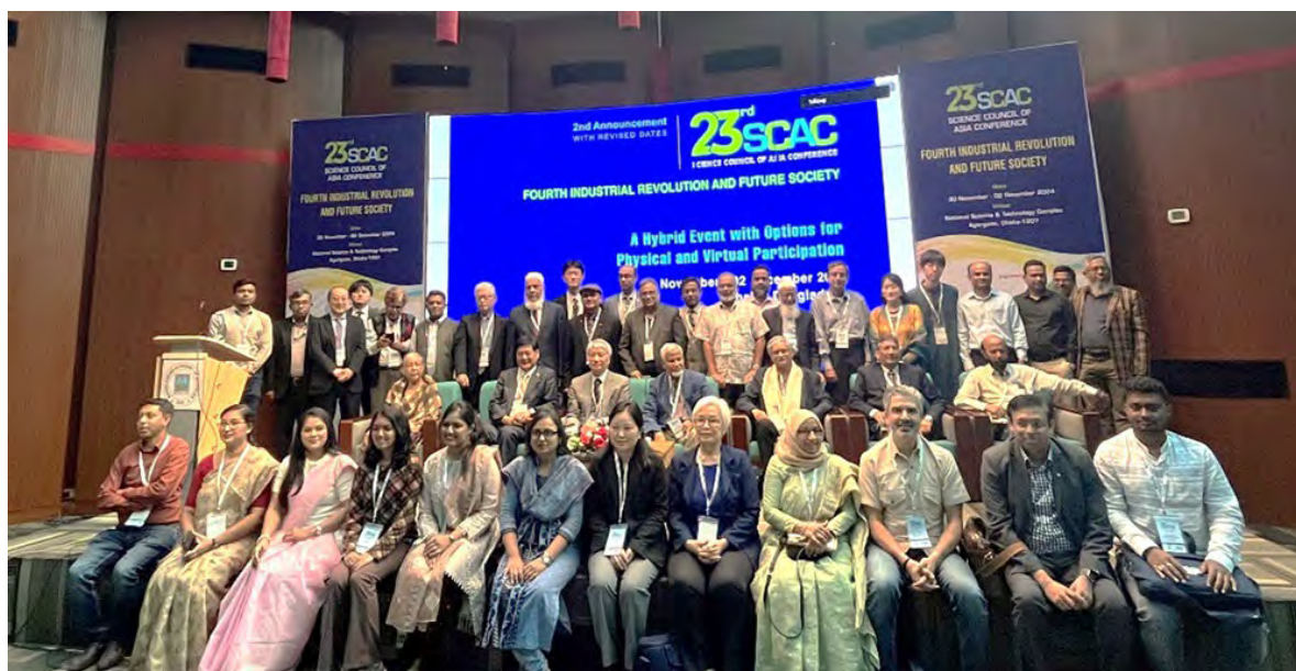
23rd Science Council of Asia Conference November 30 – December 2, 2024, Hybrid (Dhaka, Bangladesh / Online)

At present, SCA is comprised of 31 academic organizations in Asia.