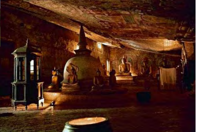
Polonnaruwa 11-13<sup>th</sup> C