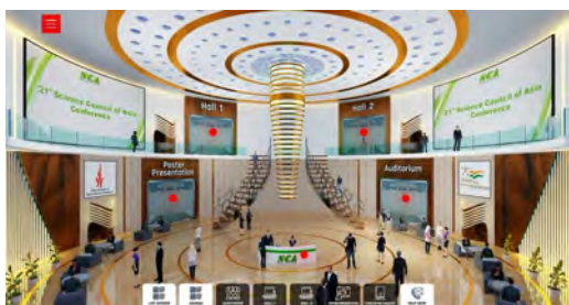
The 21st Conference Virtual Platform

The Twenty-First Science Council of Asia Conference was hosted by the Indian Council of Social Science Research (ICSSR), Ministry of Education, Government of India, under the theme "Science, Technology & Social Science Research: Together for a Better World".