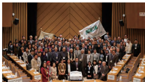
The 18th SCA Conference

December 5 to 7, 2018 Tokyo, Japan "Role of Science for Society: Strategies towards SDGs in Asia"