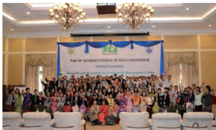
The 19th SCA Conference

December 5 to 7, 2018 Tokyo, Japan "Role of Science for Society: Strategies towards SDGs in Asia"