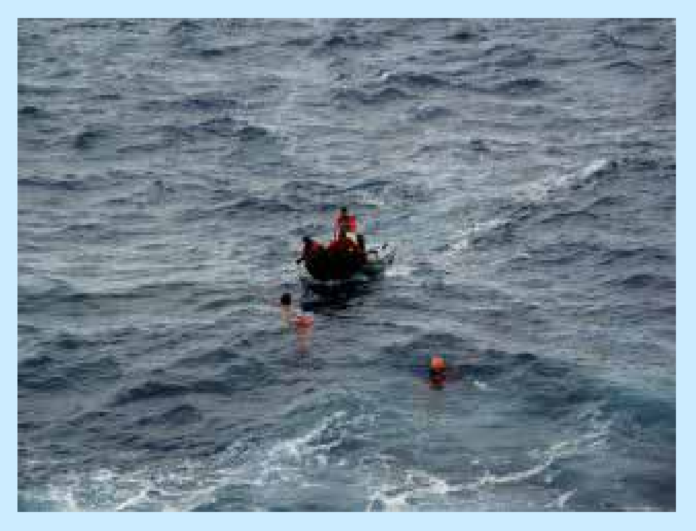
SEA SHEPHERD ACTIVISTS ABOARD A ZODIAC DHINGY THROW BUOY AND NET TO ENTANGLE NISSHIN-MARU'S PROPELLER