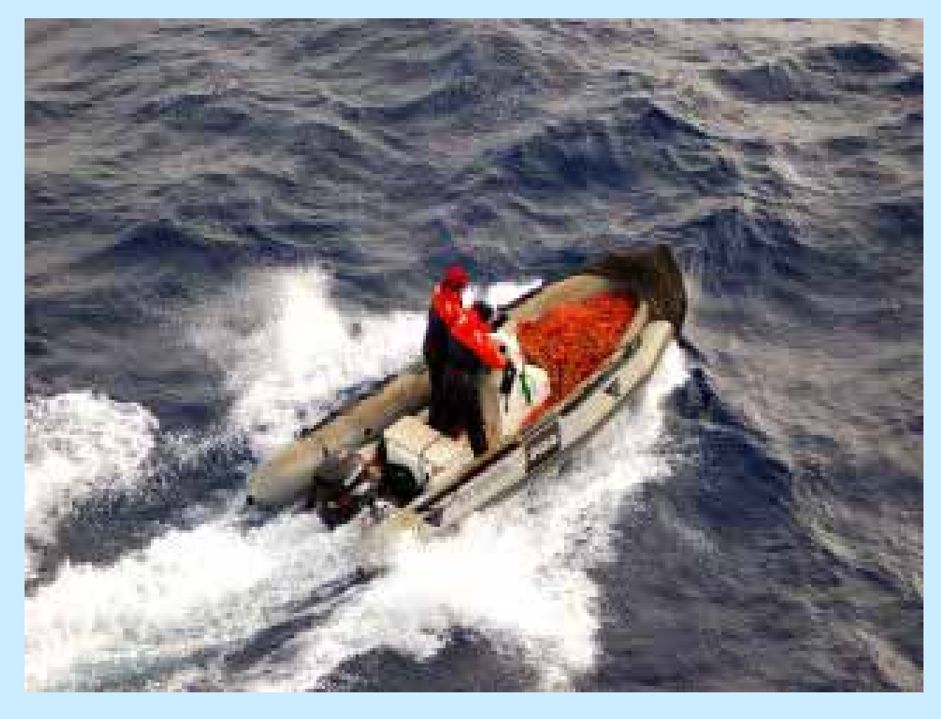
SEA SHEPHERD ZODIAC APPROACHES THE NISSHIN-MARU CARRYING A NET (INRED) TO TRY TO ENTANGLE ITS PROPELLER