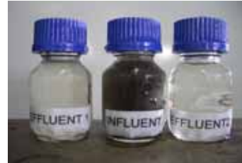
Quality of influent and effluents from 2 Hybrid reactors

Conventional aerobic treatment of municipal sewage involves use of external energy to destroy a wastewater carbonaceous source of energy. This project investigates the hybrid anaerobic system's potential for recovery of this energy as methane.