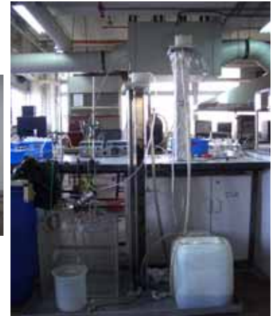
Picture of lab scale reactor setup