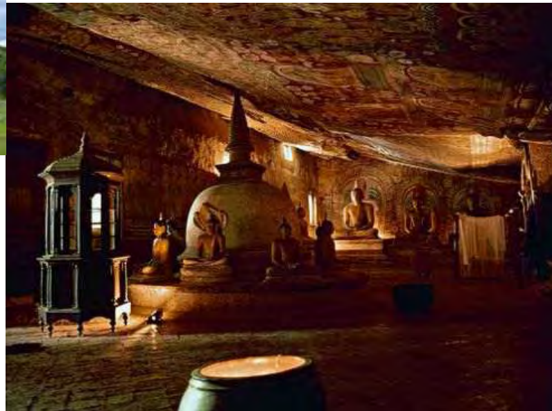
Polonnaruwa 11-13 th C