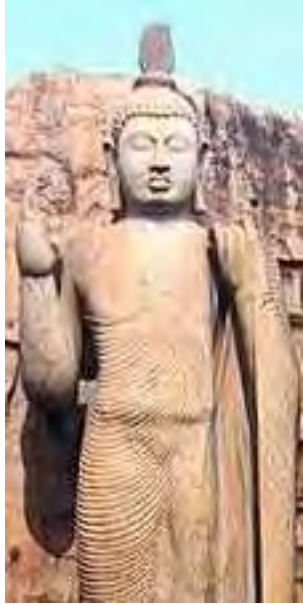
Aukana Buddha 5 th C